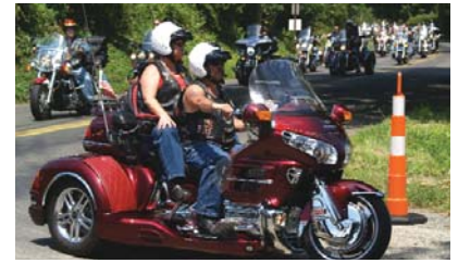
Motorcycles come in all shapes and sizes.

Throughout the afternoon, riders enjoyed food, beverages and music and shopped at several vendor tents for motorcycle merchandise.