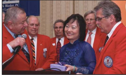
CT Burns Care Foundation Board of Directors honors Kim Phuc (“the girl in the picture” from the Vietnam War) as its Person of the Year.

procedures in 14 months by American doctors, she survived her burn injuries, calling her survival a living miracle. However, she faced life under the North Vietnamese regime as a propaganda tool, depicting the cruelty of the American-backed South Vietnamese government.